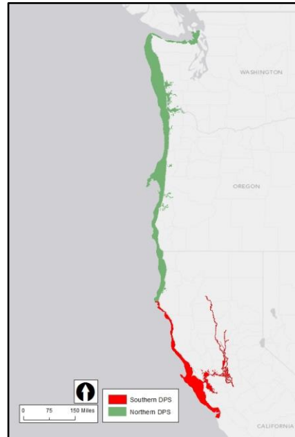
Figure 2. Northern (green) and southern (red) distinct population segments for the green sturgeon Data: NOAA 2009

of concern, and the southern population is listed as threatened.